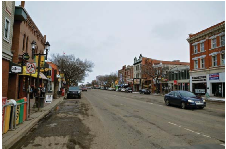
2013 – Whyte Avenue a century later at the corner of 104 street facing East.